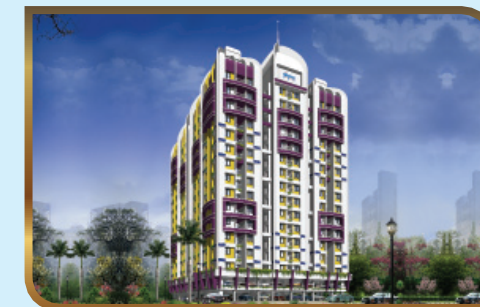
Galaxy Cloud Space Premium Apartments Near Infopark, Kakkanad