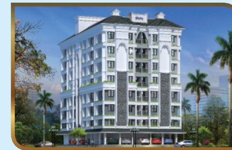
Galaxy Carlton Luxury Apartments Kadavanthra