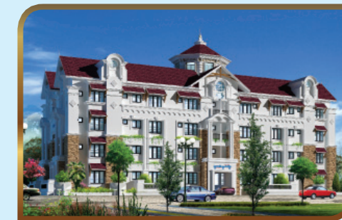
Galaxy Midwinter Luxury Apartments Kadavanthra