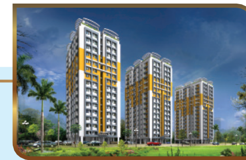
Galaxy Pine Court Luxury Apartments Near Infopark, Kakkanad