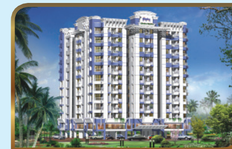
Galaxy Domain Premium 3 Bedroom Apartments Kakkanad