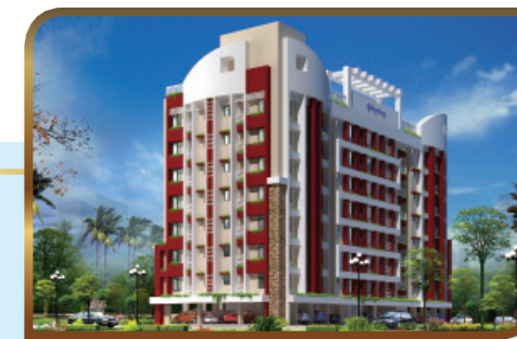
Galaxy Oxtan Luxury Apartments Kadavanthra