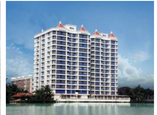
Galaxy Kingston & Galaxy Winston 3 Bedroom Waterfront Apartments Kadavanthara