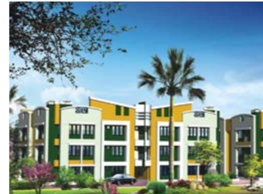
Galaxy Ebony Grove Luxury Apartments Palarivatton