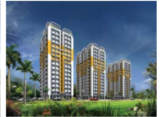
Galaxy Pine Court Luxury Apartments Near Infopark, Kakkanad