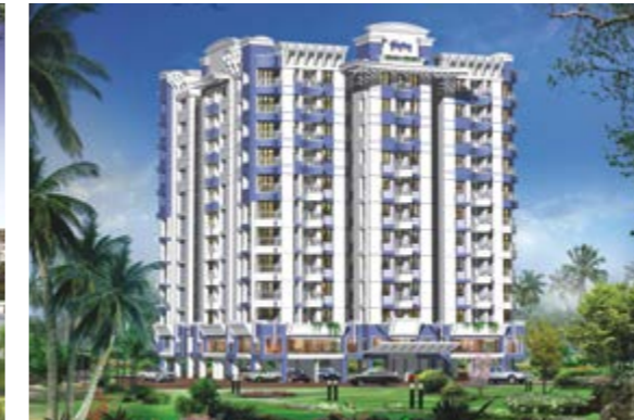
Galaxy Domain Premium 3 Bedroom Apartments Kakkanad