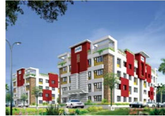
Galaxy Techno Valley Luxury Apartments Near SmartCity