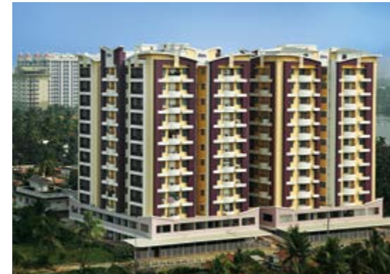
Galaxy Clifford Luxury 3 Bedroom Apartments Kadavanthara