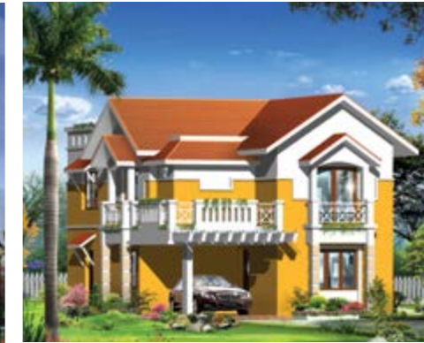
Galaxy Wintergreen Premium Villas Near Veegaland, Off Kakkanad