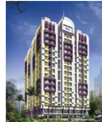
Galaxy Cloud Space Premium Apartments Adjacent to Infopark, Kakkanad