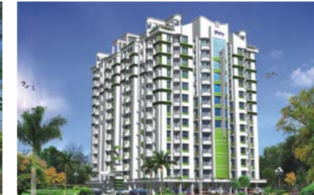
Galaxy Greens Premium 3 Bedroom Apartments Kakkanad