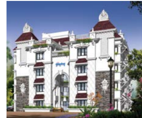
Galaxy Castello Luxury Apartments Opposite to Gold Souk Grande