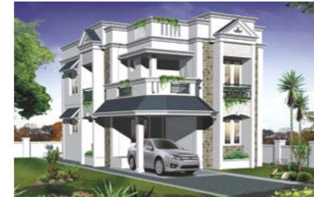
Galaxy Green Woods Luxury Villas Near Tripunithura