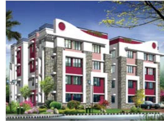
Galaxy Cherry Woods Luxury Apartments Kaloor