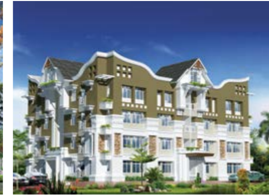
Galaxy Peach Garden Luxury Apartments Kaloor